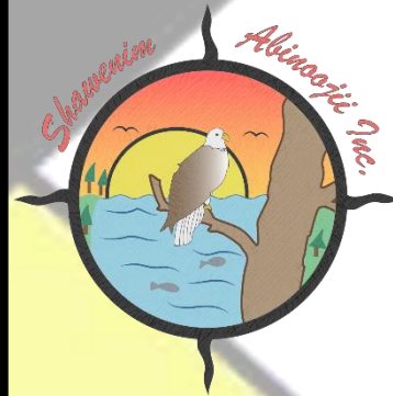
Little Grand Rapids First Nation