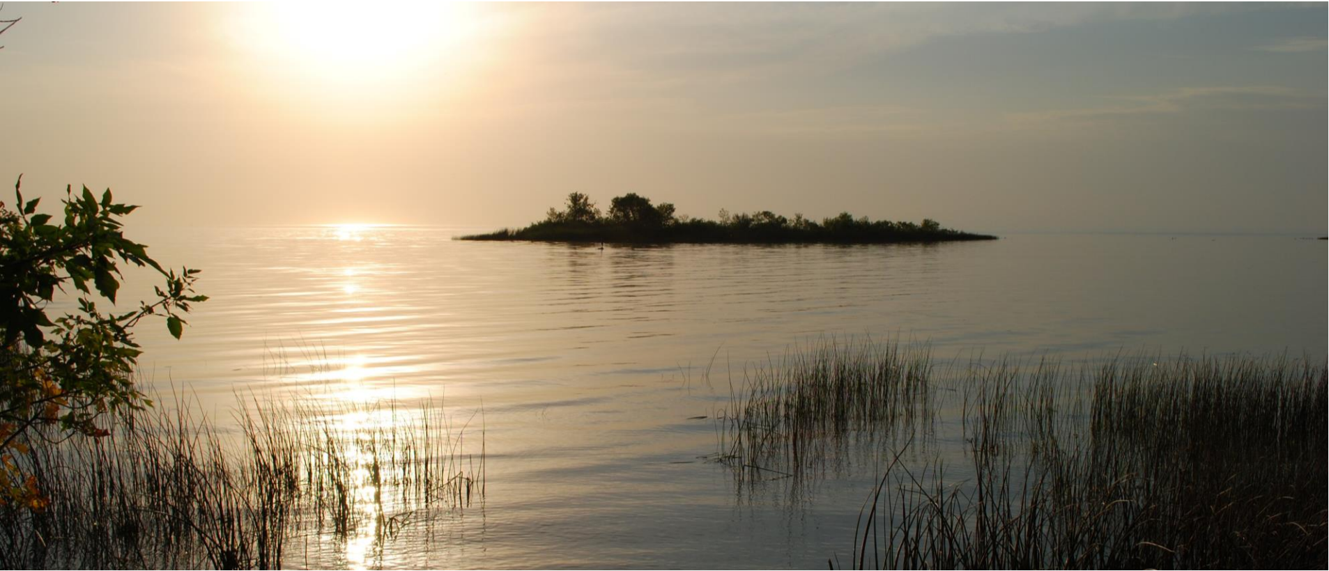
Bloodvein First Nation