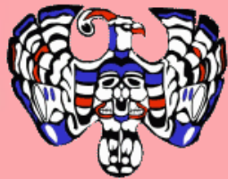
Poplar River First Nation