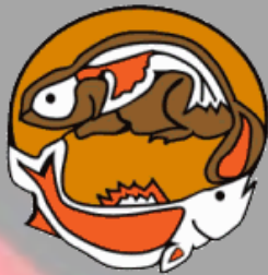
BLACK RIVER FIRST NATION